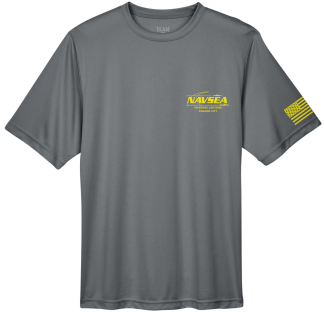
A-GNP10372-NAVSEA PANAMA DRIFIT TEE- CHARCOAL